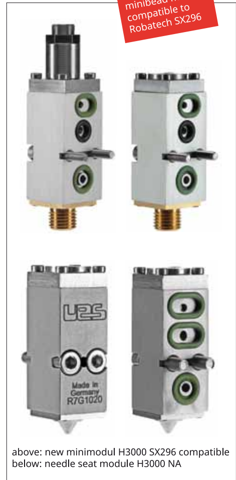
above: new minimodul H3000 SX296 compatible below: needle seat module H3000 NA

NEW also available H3000 UES minibead module compatible to Robatech SX296