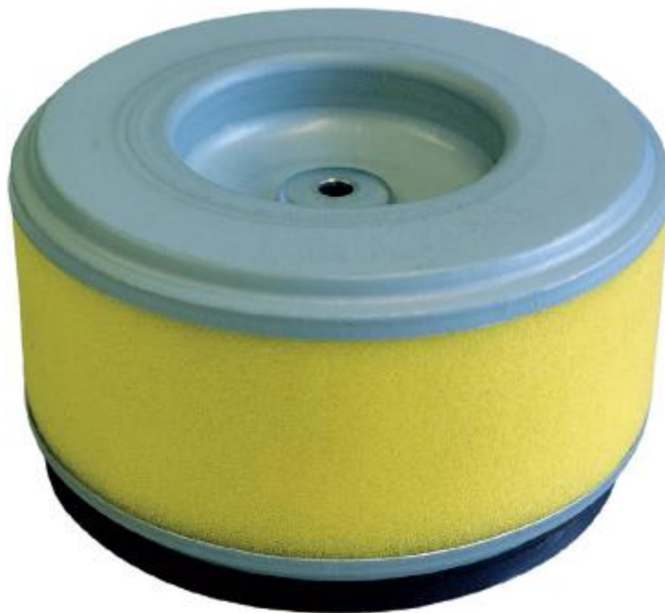
Article number 135113 - Air filter

If a fault (alarm) occurs during operation of the PowerFill, this alarm must be acknowledged via the "Filling Level" control panel in the main view of the perfectMelt .