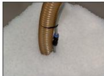
Correct: The lance is pressed deeply into the granules