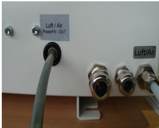
External air connection for lance

Insert the lance at the other end of the delivery hose deep into the granules. In order to ensure that this functions perfectly, make sure that there is plenty of freedom of movement. In this way the vibrator of the lance can crush any potential clumps.