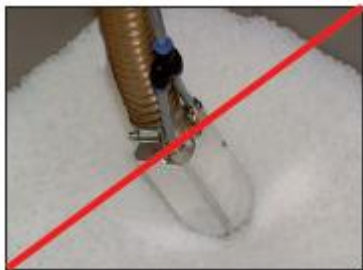
Wrong: The lance is positioned on top of the granules

Insert the lance at the other end of the delivery hose deep into the granules. In order to ensure that this functions perfectly, make sure that there is plenty of freedom of movement. In this way the vibrator of the lance can crush any potential clumps.