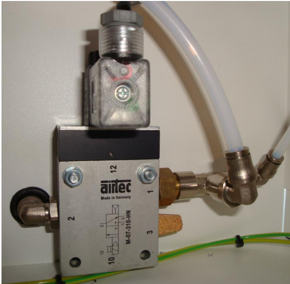
Solenoid valve (internally installed)